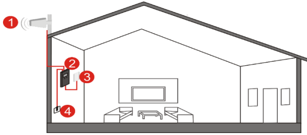
1-Outdoor directional antenna 2-Booster 3- Indoor panel/omni antenna 4-Power supply

a) Optional Panel Pro kit or Omni Pro Kit (+1x indoor panel/omni antenna+1x 35 ft (10.6m) low-loss Hiboost5D cable)