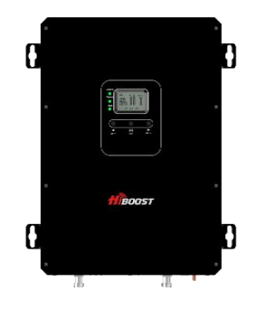
Amplifier easily mounts to any wall. No rack required. Its well-designed thermal management heat sink ensures cool operation, long life and reliability

This is a full-featured professional grade bi-directional amplifier that includes a very sophisticated gain control and automatic shutdown for network protection. Providing a highly smart Automatic Level Control (ALC) and Isolation gain processing system to adjust its uplink and downlink gain, it prevents self-oscillations, optimizes signal levels and prevents overload from nearby high-power towers.